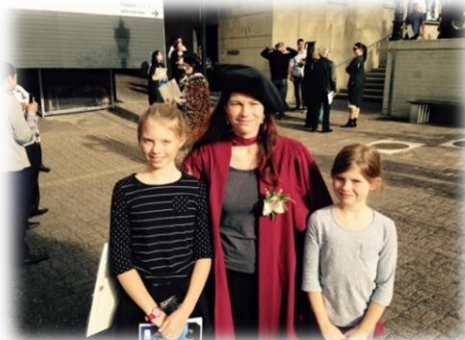
The mother is awarded with the highest academic honors