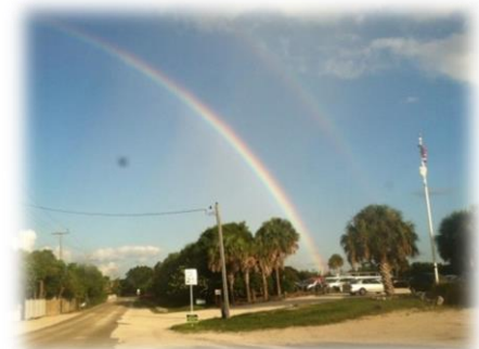
Casey Key, "our" island and the west coast of Florida with stunning cloud formations and rainbows