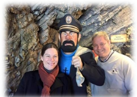
Dietmar loves this Photo of Marks camera as it symbolises a memorable past