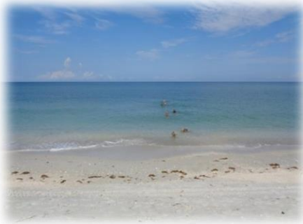
The Gulf of Mexico