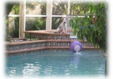
An image of our beloved dogs had to be included with this page