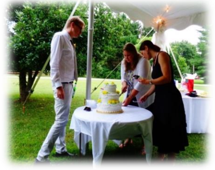
The golden wedding cake is distributed by their children