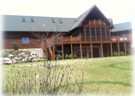
The beautiful log home of Don and Diane induces circular grass growth