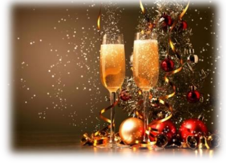
Prosit Neujahr 2016