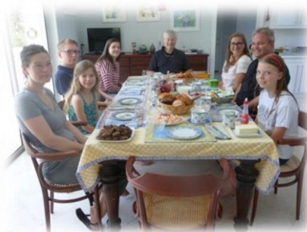
In June we had a family reunion in our house on Casey Key