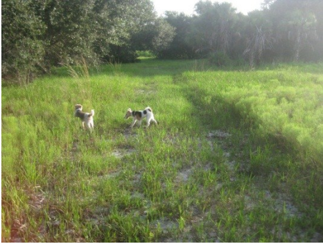
Milou and Struppi in a Florida forest