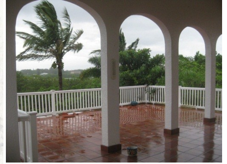
Even small hurricanes crash tiles