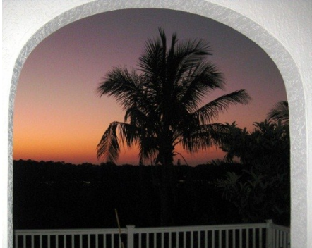
Sunrise at Gulf Winds Way