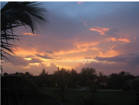
Sunset at Casey Key Estates