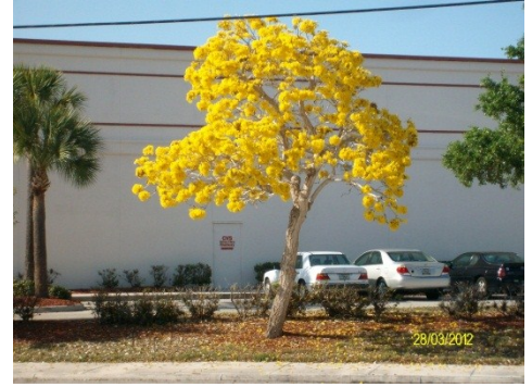
Each spring we enjoy the color of the Yellow Elder or Tabebuia aurea tree