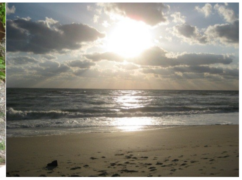
The Beach – the Gulf - the Sun